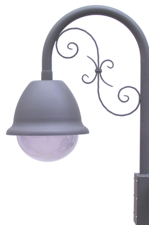
CSI250+STA250 -old style-